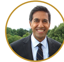
Dr. Sanjay Gupta WHF 1997–98 Chief Medical Correspondent, CNN