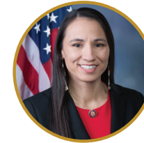
Sharice Davids U.S. Rep., Kansas 3rd District WHF 2016–17

Below are just a few examples of Fellows currently serving in their communities who continue to use their leadership skills in exemplary ways.