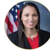
Sharice Davids U.S. Rep., Kansas 3rd District WHF 2016–17

Below are just a few examples of Fellows currently serving in their communities who continue to use their leadership skills in exemplary ways.