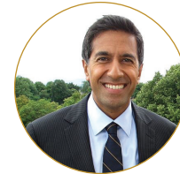
Dr. Sanjay Gupta WHF 1997–98 Chief Medical Correspondent, CNN