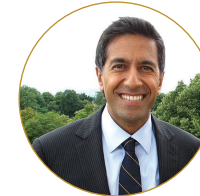
Dr. Sanjay Gupta WHF 1997–98 Chief Medical Correspondent, CNN