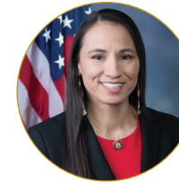
Sharice Davids U.S. Rep., Kansas 3rd District WHF 2016–17

Below are just a few examples of Fellows currently serving in their communities who continue to use their leadership skills in exemplary ways.